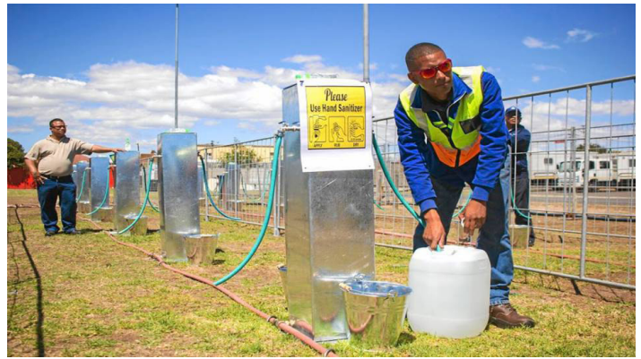
A water filling station in Capetown, South Africa

No one who lives in an arid, high alpine desert such as the San Luis Valley takes for granted those short bursts of welcome water, especially not when we know those rainstorms are capricious beasts. In 2017, the Valley received record amounts of rain, enough to put us on the national weather map. In 2018, the parched irrigation ditches and thirsty crops reminded us that once again, Mother Nature had chosen to withhold. Weather patterns, climate change, all of these major events are beyond our control. Humans have ever been at the mercy of weather, that's why we choose to settle at the bottom of mountains where the snows melt into the rivers if we are in a rain-deprived area. Traditional acequias were built purposely to catch every last bit of snowmelt, direct it onto the crops, and then allow it to continue on its way for downstream neighbors. Rain and snow are the only ways that Colorado receives fresh water, and it's the only water we have for crop irrigation, recreation, and municipal use, which includes the small percentage of water that is considered potable, or drinkable.