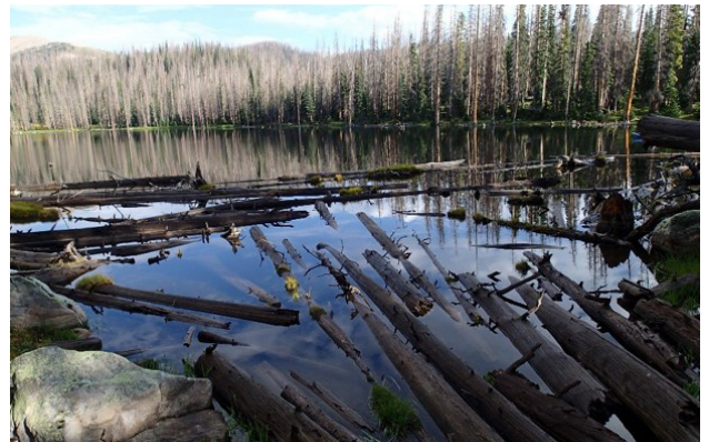
Above: Beetle kill spruce clog the spillways of Spruce Lakes Reservoirs