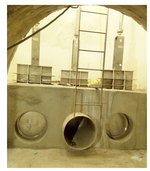
Functional AND effective