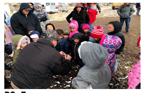
PG. 5 Updates from around the State