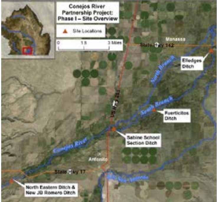
The Elledges Ditch (left) and the project map detailing each ditch's location along the Conejos River main stem and South Branch (above).