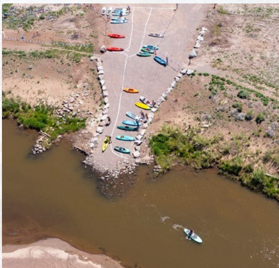
Recreational Boating

Lakes and reservoirs also offer unique recreational opportunities. From remote, high mountain lakes to reservoirs accessible by vehicle and outfitted with boat ramps and handicap amenities, you'll be sure to find water suitable for your style. While some lakes/reservoirs, such as Smith Reservoir and Continental Reservoir, allow motorized boats, others do not.